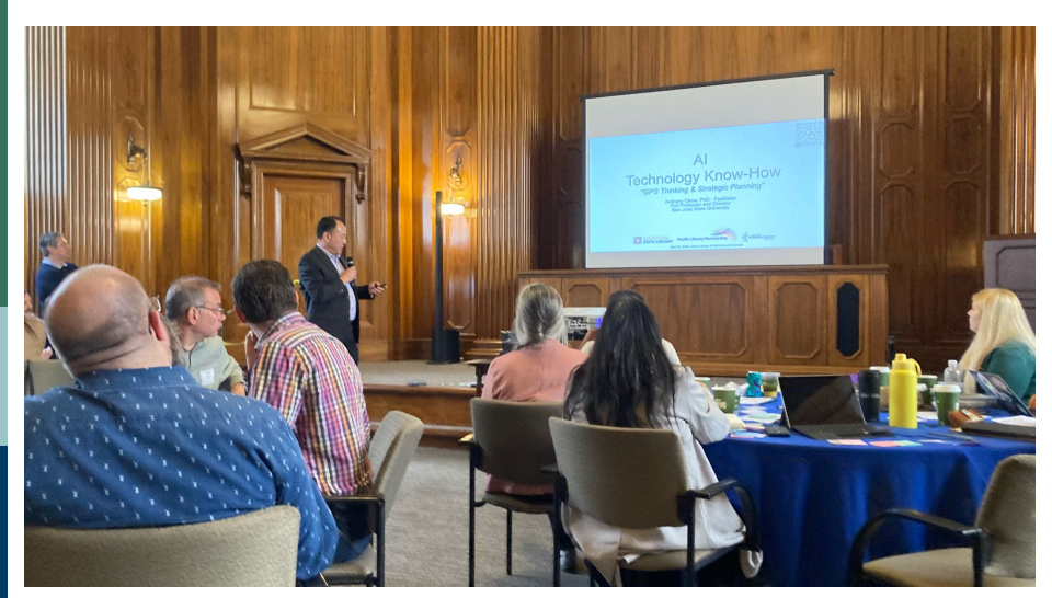
California Al and Libraries Summit, Sacramento, California, April 2024.