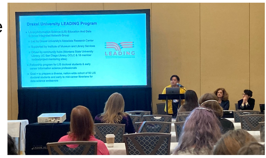
LEADING team members present at the Digital Library Federation annual meeting, St. Louis, Missouri, November 2023.