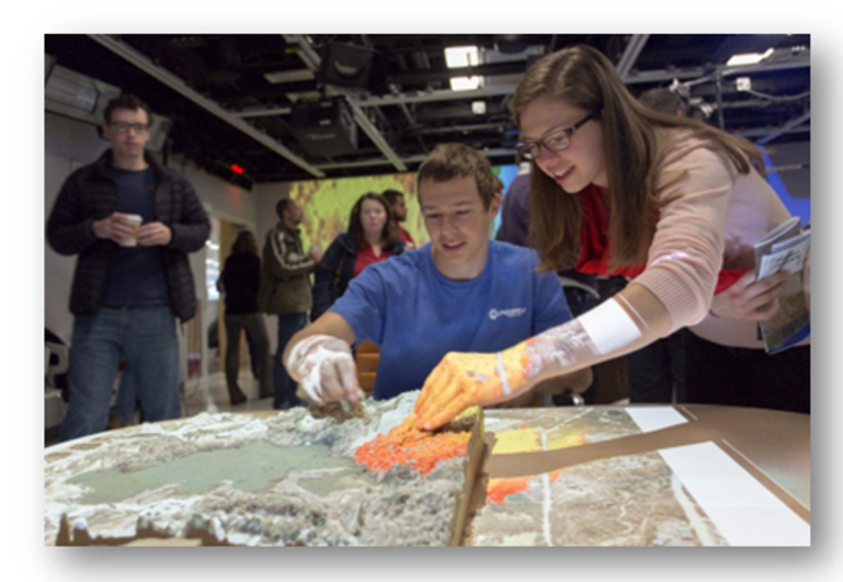
Tangible Landscapes Coffee and Viz Event. October 29, 2019