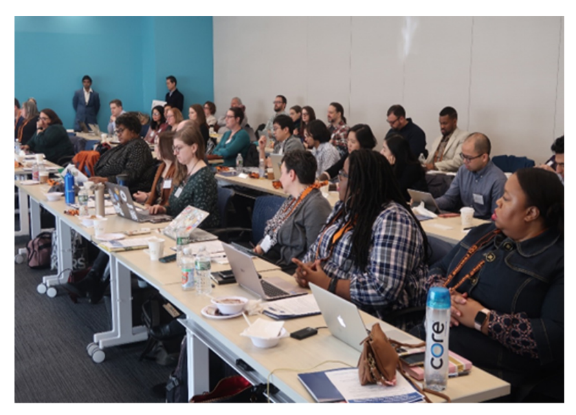
LEADING forum attendees, RE-246450-OLS-20, Photo courtesy of "Metadata Research Center, College of Computing and Informatics, Drexel University"