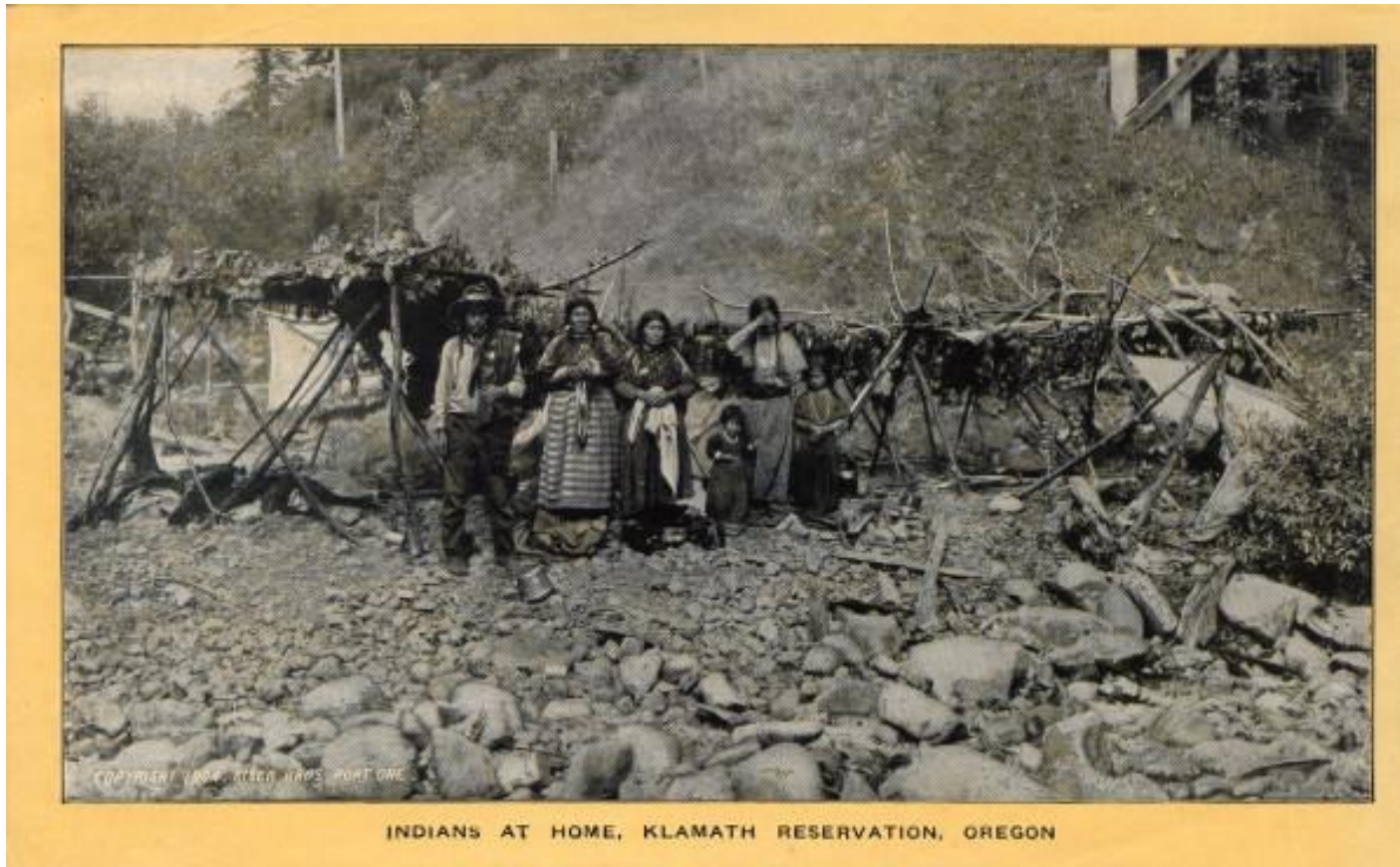
Indians at home on the Klamath Reservation, Oregon.