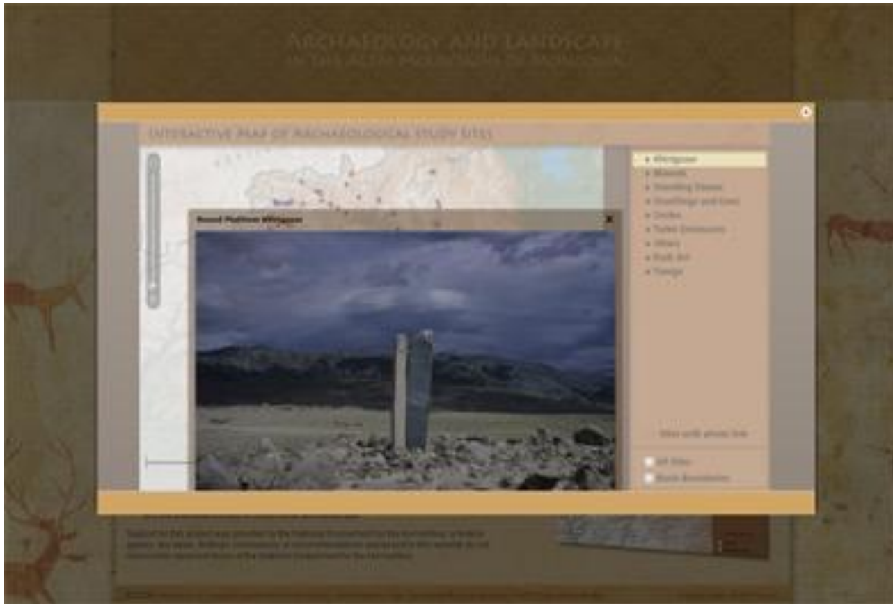
Archaeology and Landscape in the Altai Mountains of Mongolia