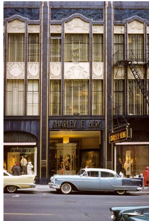
Berg, Charles F., Store (Portland, Oregon) http://oregondigital.org/lu?archpnw.2578